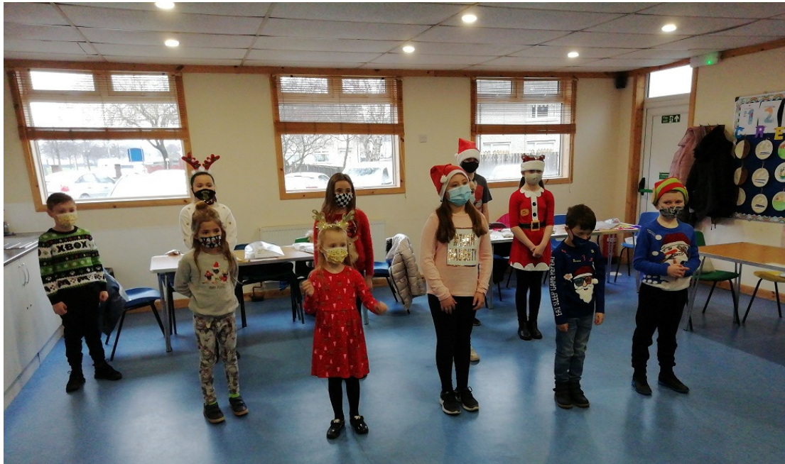
The children learning to sign 'Merry Christmas Everyone' for their Nativity in December