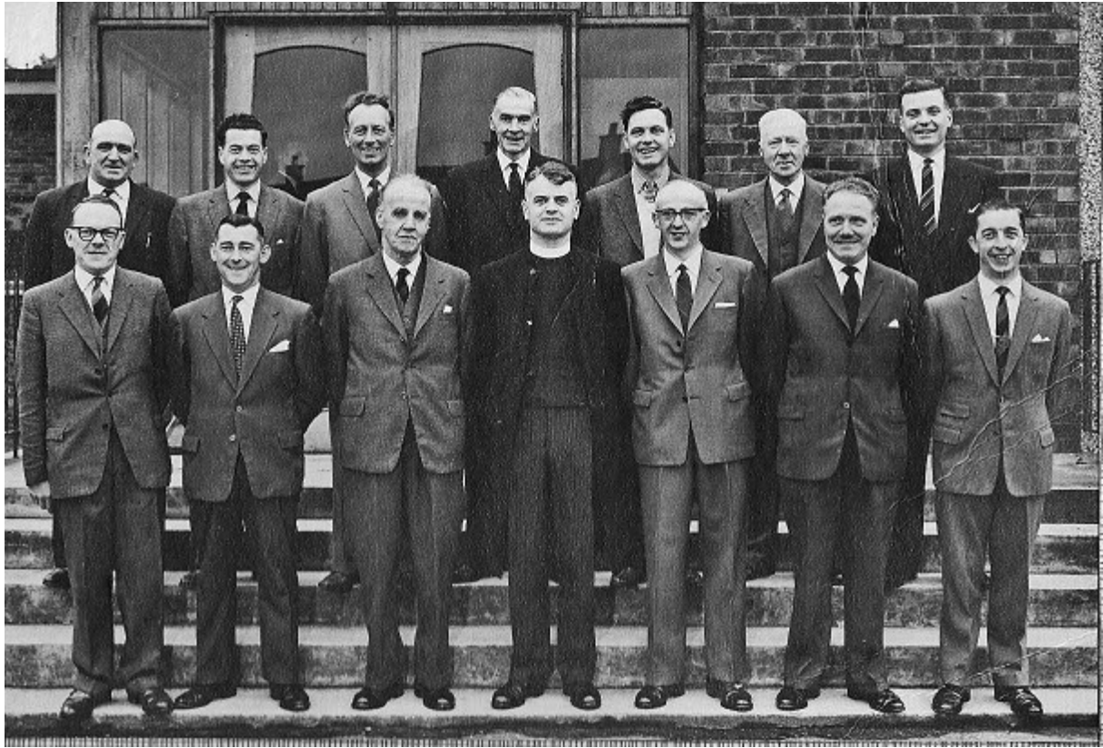
The Kirk Session of Burnhead Parish Church