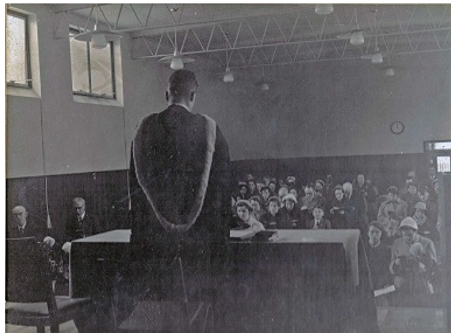
Church Service in Burnhead Parish Church