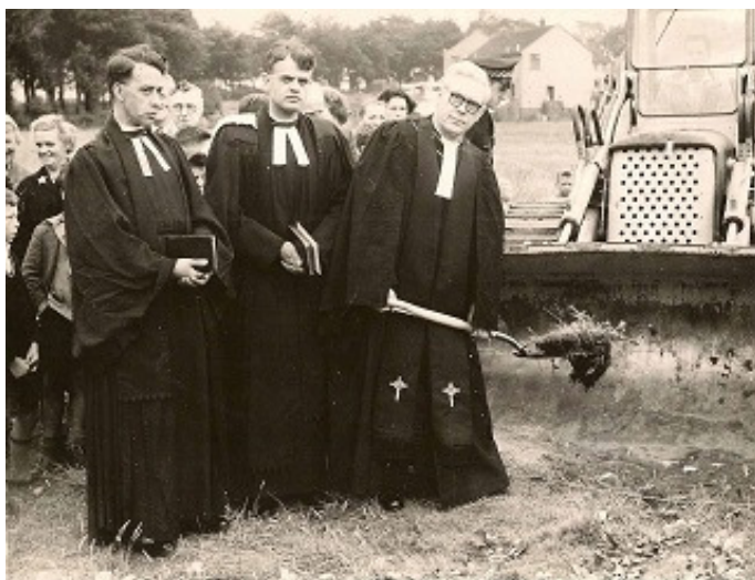
Cutting of the first sod of today's church buildings

A major decision by the extension committee had a huge effect on Burnhead. The original plan was to build a hall/church. This was changed to a hall and church. The architects, Davidson's of Airdrie, claim that Burnhead Church was one of their best designs.