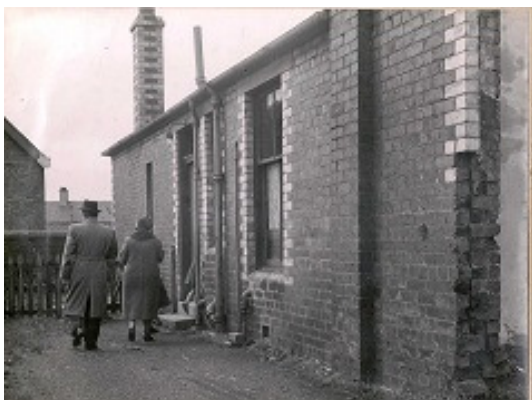
Attending the first service

The first service was held on Sunday 9th October, 1955. Seats for the congregation were provided by Chalmers Church.